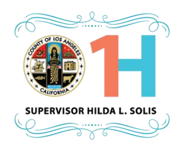
Supervisor, District 1 Los Angeles County Board of Supervisors